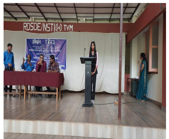
Speech by trainees