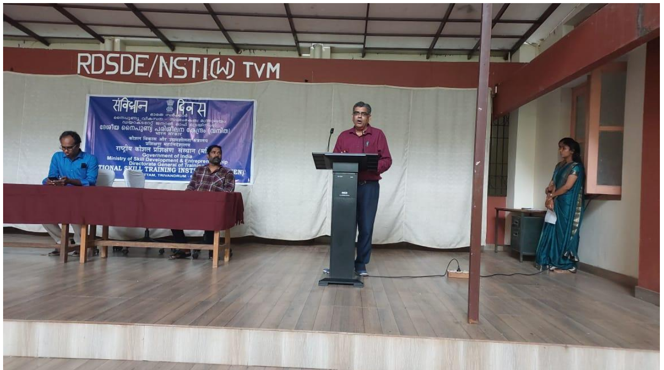
Read Preamble by Regional Director , Staff Members of RDSDE /NSTI(W) and trainees