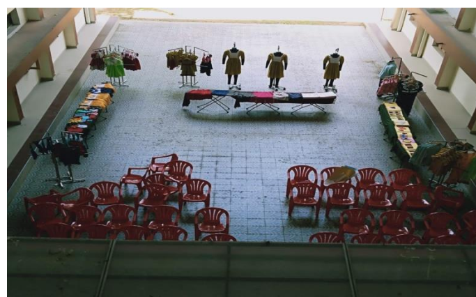
Gallery Shows arrangement before expert talk