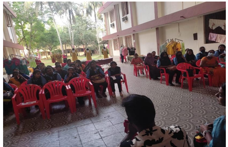
Gallery Shows for the audience – dresses designed and stitched by DM students