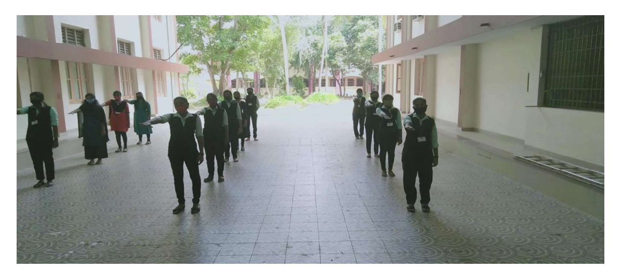
Pledge by trainees _pic3