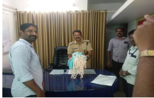
Mask Distributed to Kerala Police