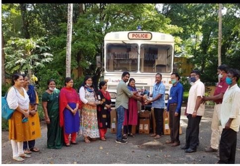
Mask Distributed to Kerala Police Team