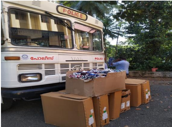
25000 Mask Distributed to Kerala Police Team